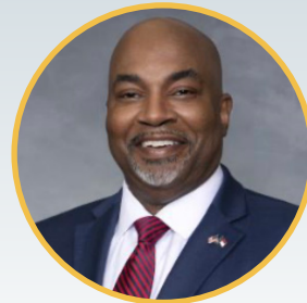
Republican Gubernatorial Nominee